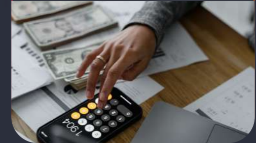
Finance & Accounting